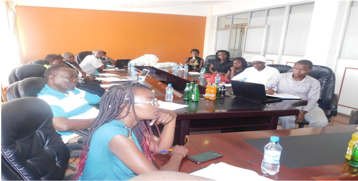
Fig. Participants during the Dialogue

Other photographs for the meeting include