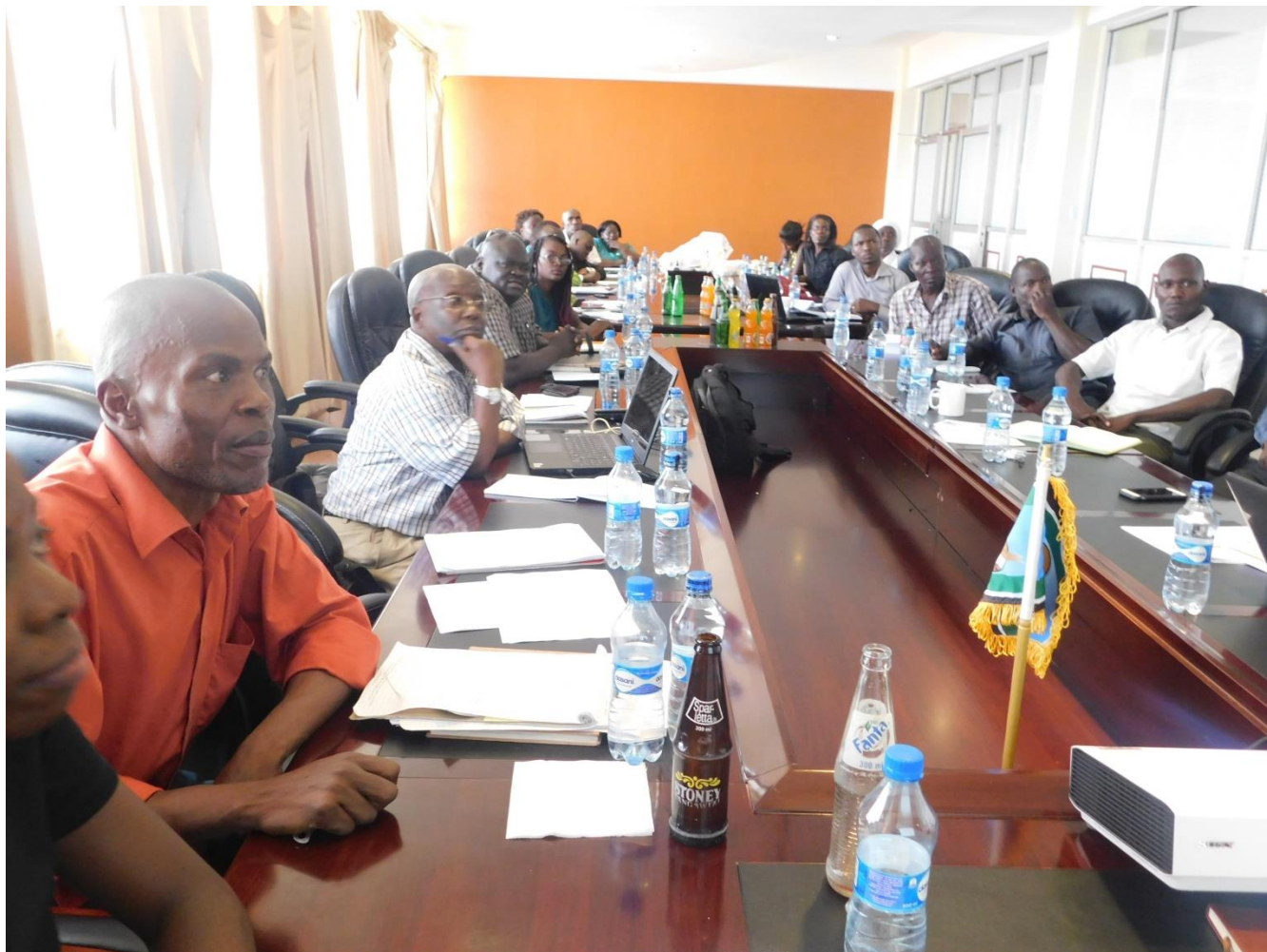
Participants Attending Delta Alliance-Kenya Wing Nyando Delta Policy and Decision Makers Dialogue in Nairobi, Kenya Organized by the Wing